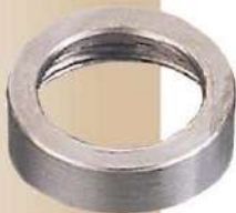
Female Bush Size: 20mm, 25mm