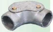
Elbow Inspection Size: 20mm, 25mm