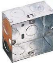
Switch & Socket Box Size: 1 Gang x 16mm & 25mm, 1 Gang x 35mm & 47mm, 2 Gang x 25mm & 35mm, Duel Box x 35mm