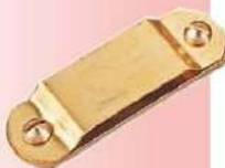
Brass Tape Clips Size: 20mm x 3mm 25mm x 3mm & others