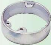
Extension Ring Size: 10mm to 50mm