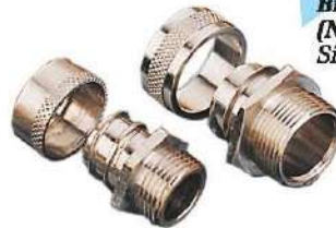
Brass Connectors (Male & Female) (Nickle Plated) Size: 1/2" x 10mm to 2" x 2"