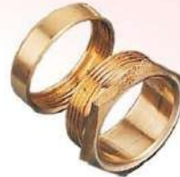
Brass Male / Female Bush Size: 16mm to 50mm 3/4" to 2"