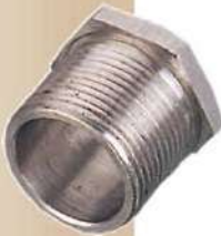
Male Bush Size: 20mm, 25mm, 32mm