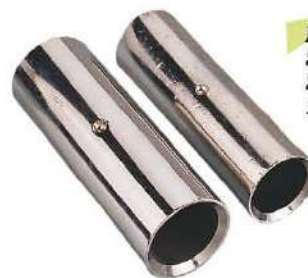
Ferules (In Line Connector) Splices Size: 1.5mm 2 to 1000mm 2