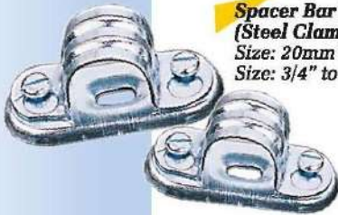
Spacer Bar Saddle (Steel Clamps) Size: 20mm to 50mm Size: 3/4" to 2"