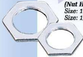
Lock Nut - Hexagonal (Nut Hex) Size: 16mm to 50mm Size: 1/2" to 2"

Steel - Cast Iron (Finish: Galvanised - Black)