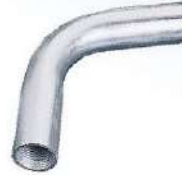
Normal Bend Size: 20mm, 25mm, 32mm