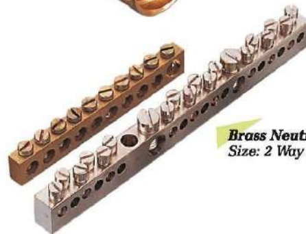
Brass Neutral / Earth Links Size: 2 Way to 40 Way