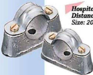
Hospital Saddle Distance Saddle Size: 20mm, 25mm