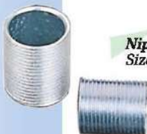
Nipple Size: 20mm, 25mm