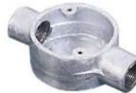
Circular Box Type: 1,2,3,4 way Angle- U-H-Y- way. Size: 20mm - 25mm