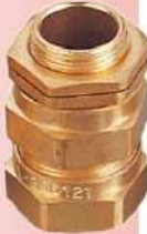
Brass Cable Gland Type: CW Size: 16mm to 90mm