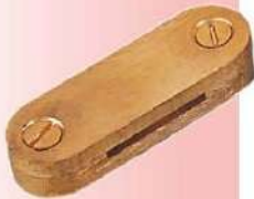
Brass D.C. Tape Clips Size: 20mm x 3mm 25mm x 3mm & others