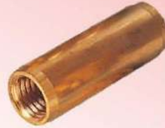
Brass Couplings Size: 5/8" & others