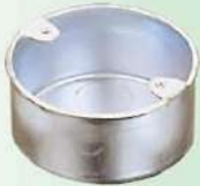
Looping Box Type: 1,2,3 Holes & 4 K.O. Size: 32.0mm Deep x 63.3mm