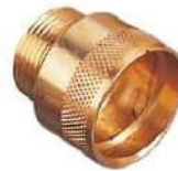
Brass Adaptors (Male & Female) (Self Finish) Size: 1/2" x 10mm to 2" x 2"