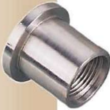
Flange Coupler Size: 20mm, 25mm, 32mm