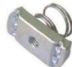
Spring Nut Type: Plain, Short, Long Size: 6mm to 12mm