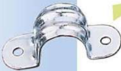
Plain Saddle (Steel Clamps Plain) Size: 20mm, 25mm, 32mm