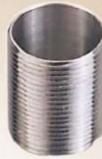
Nipple Size: 20mm, 25mm