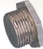
Hex Stop End (Plug) Size: 20mm, 25mm