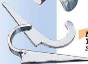
Flat Crampet Twisted Crampet Size: 20mm, 25mm