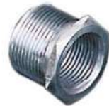
Reducer Size: 25mm x 20mm 20mm x 16mm 32mm x 20mm 32mm x 25mm