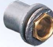
Flange Coupler Size: 20mm, 25mm