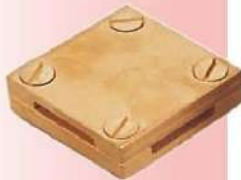
Brass Square Clamp Size: 20mm x 3mm 25mm x 3mm & others