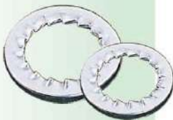
Serrated Washers Size: 16mm to 90mm Size: NPT- 1/2" to 4"