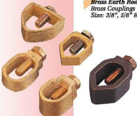
Brass Earth Rod Clamps Brass Couplings Size: 3/8", 5/8" & others