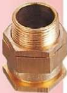
Brass Cable Gland Type: A-2 Size: 16mm to 90mm