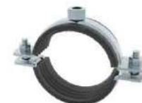
Double Rubber Pipe Clamp Size: 3/4" to 6"