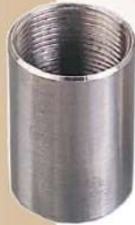
Coupler Size: 20mm, 25mm, 32mm