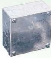
Steel Adaptable Box Size: 3" x 3" to 12" x 12" & 1.5" to 6" Deep