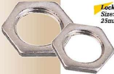
Lock Nut Size: 20mm, 25mm