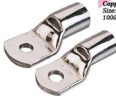
Copper Cable Lugs Size: 1.5mm 2 to 1000mm 2