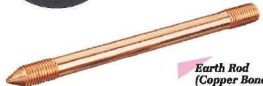
Earth Rod (Copper Bonded) Size: 3/8", 5/8"