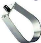
Sprinkler Clamp Size: 3/4" to 6"