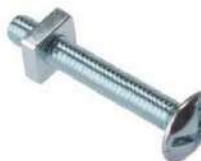
Roofing Bolt and Square Nut Size: M6 x 8mm to M6 x 50mm