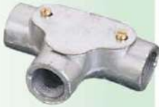
Tee Inspection Size: 20mm, 25mm