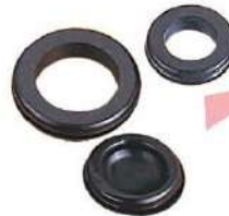
Grommet Super Grommet (Open / Blind) Size: 20mm to 50mm