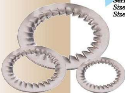
Serrated Washers Size: 16mm to 90mm Size: NPT 1/2" to 4"