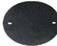
Gasket For: 20mm - 25mm Circular Box