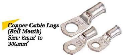
Copper Cable Lugs (Bell Mouth) Size: 6mm 2 to 300mm 2