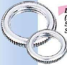
Lock Ring - Milled Edge (Nut Round) Size: 16mm to 50mm Size: 1/2" to 2"