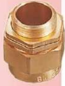
Brass Cable Gland Type: BW Size: 16mm to 90mm