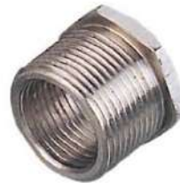
Reducer Size: 25mm x 20mm