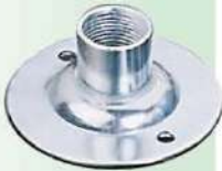
Dome Cover Size: 20mm, 3/4"